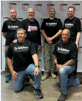
The Godfathers of Cinderella's Closet

A huge "Thank you" to the men and women behind our mission that assist in set up and tear down.