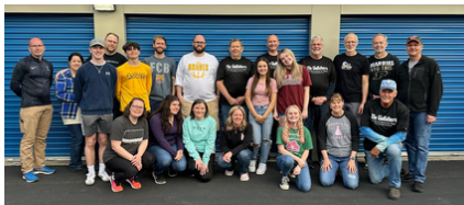
Grant County High School Volunteers